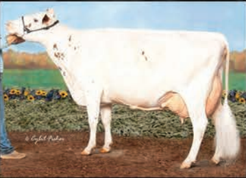
JOMILL-POKER KEEGAN, EX-94 4E VICKING Spring Yearling great-granddaughter sells