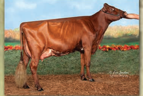
Hard Core Jstice Ramira EXP ET EX90 Selling Sept Cyride daughter & SR 2 Yr Old full sister to Ramira who was Int Champion Winter Nat'l 2022 & 1<sup>st</sup> SR 3 Yr Old. Backed by EX95 O'Raely!

June 17th ::: Fraley's Dairy Complex ::: Muncy, PA Selling 50 Milking Shorthorns ::: 20 Guernseys ::: 20 Jerseys