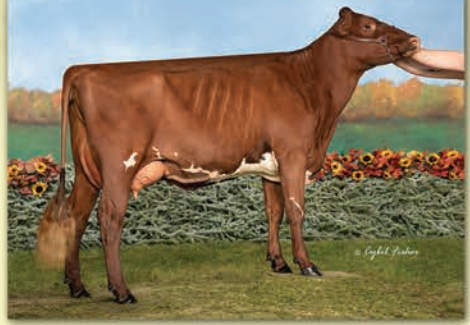
KNH Endres MD Devil Anse Cece VG88 HM All-American JR 2 Yr Old & 3<sup>rd</sup> JR 2 Yr Old WDE 2022 Selling MD Justice Summer Yearling daughter! Next dam is 2022 UAA 5 Yr Old EX94 Caliente!