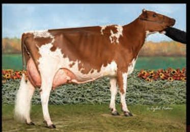
STILLMORE B-KING IRENA, EX-91 Unan All-American Milking Yearling, 2020 Res Int Champion, 2022 Midwest National Selling choice of 3 fall 2023 pregnancies by REYNOLDS or RINGER