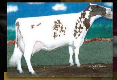
VALEVUE BBK MINERVA, EX-96 2E 5-08 365D 38,236M 5.7% 2162F 3.2% 1216P 5X All-American 3X Central National Show Grand Champion Minerva's DISTINCTION 2-yr-old granddaughter sells

JUNE 30, 2023 | 6:30 PM | THE GREAT FREDERICK FAIRGROUNDS 797 E PATRICK ST | FREDERICK MD, 21701