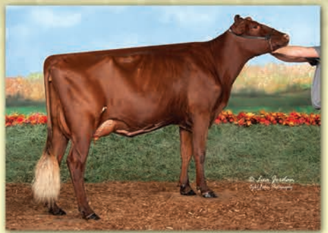
SF HC Laci Payment EXP ET VG87 Sells Fresh 2<sup>nd</sup> Lactation & ready for the JR 3 Yr Old class! Nom AA JR 2 Yr Old, 1<sup>st</sup> JR 2 Yr Old Eastern Nat'l & 1<sup>st</sup> Winter Nat'l. A Destry Lad by 2010 WDE Champion Peri!