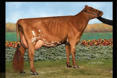
SUNNY-ACRES KS KOTTON, EX-90 Nom All-American JR 3-Yr-Old, 2022 Next 2 dams are EX She sells!