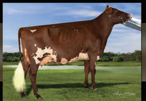
GIN-VAL RR ZEUS CREMEBRULEE VG 86 Cremebrulee Fall Calf by Wildside sells! 2<sup>nd</sup> Dam Heavenly Creampuff 2E-92 Res Grand Northeast All Breeds Show 2018

MAPLETON VLY RR MEMPHIS EXP EX 91 Her POLLED maternal sister by Alrite-P sells! Due July 14<sup>th</sup> to Mr. Right with ultrasound heifer Dam: Perfect Miami 3E-90 Lifetime: 110,640M 4649F 3616P Mapleton Valley Farms