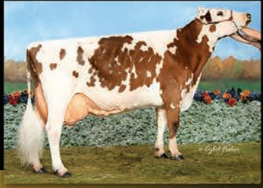
GRAND-VIEW SUMTOTAL DIVOT, EX-94 4E 7-05 365D 25,220M 3.6% 914F 3.2% 819P HM All-American 100,000 Lb Cow, 2015 Selling choice of 3 REAGAN & 1 KINGSIRE from her polled granddaughter