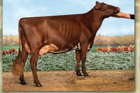
KNH Endres Zeus Legendary EX92 2E 3X Unanimous All American 2017 Jr Champion WDE First public offering EVER out of Legendary: Ricochet September daughter!