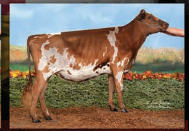
GRAND-VIEW VICKING DREAM ON-ET NOW VG-86 Nom All-American Fall Yearling, 2022 Next dam is 9<sup>th</sup> gen EX, Grand-View HP Calimero Dane-ET Followed by Grand-View BBBK Dreamer, EX-94 SE KINGSIRE Spring Calf sells