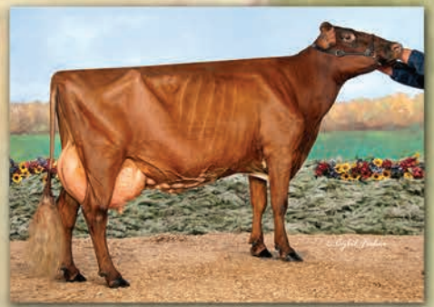
Hard Core Premium Skiddle EXP EX93 2E 1<sup>st</sup> 5 Yr Old Eastern Nat'l & Nom All American 2019 Selling her Cyride Winter Yearling, 5<sup>th</sup> Winter Calf Winter Nat'l 2022 More family members sell from the great Stella 905 family!