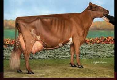
TOPPGLEN WISHFUL THINKING-ET EX-94 4E 3-03 305D 20,210M 6.7% 1348F 6.1% 1232P 2x Unan All-American BURDETTE x Wishful Thinking embryos sell!

We are so excited to host our fellow Ayrshire breeders in Maryland! Follow us on Facebook for sale updates & pictures: 2023 National Ayrshire Convention – Maryland