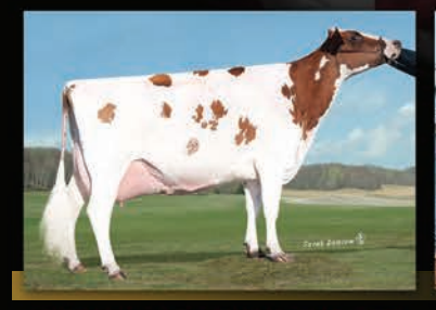
GATTON PARDNER JEZABEL, EX-94 5E Life: 3,491D 163,450M 4.0% 6466F 3.3% 5353P VICKING 2-Yr-Old granddaughter sells