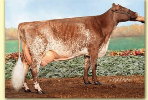
HC-HP Red Rob Fireball EXP ET EX95 Two Mudslinger milking daughters sell Cyride December family member sells Summer JR 2 Yr Old Zeus family member sells