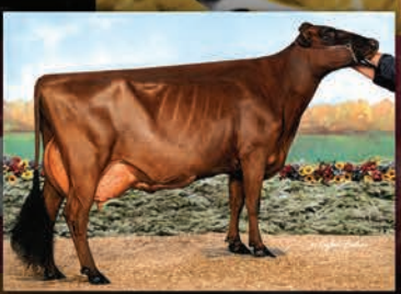
MOWRY'S BURDETTE MOJO, EX-93 2E 5-04 358D 22,800M 3.5% 809F 3.3% 757P Nom JR All-American JR 3-Yr-Old, 2018 Her REAGAN Winter Calf sells