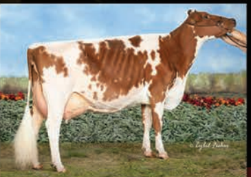
SWEET-PEPPER BLACK FRANCESCA EX-94 3E 6-09 305D 34,560M 4.3% 1480F 3.1% 1082P 3X Unan All-American & 2X WDE Grand March 2024 choice sells from REAGAN granddaughter