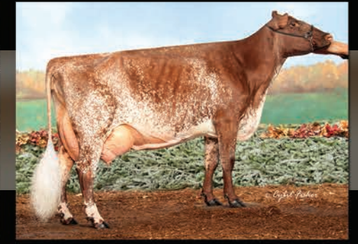
HC-HP RED ROB FIREBALL EXP ET 4E-96 December 2017 daughter by Innisfail Perfection Sells

KRAUSES SEC TEMPTATION 668 Selling choice of 4 Yr-Old Sec Temptation 668 & SR 3 Yr-Old Mykola Delia 799 Temptation 668 fresh 01/23, producing 112 lbs/d, dam over 100,000 Lifetime. Delia 799 fresh 02/23, sired by Mykola from an Ecuafarm Peris Kaiser with over 100,000 Lifetime. Either cow will elevate your breeding program & show string!